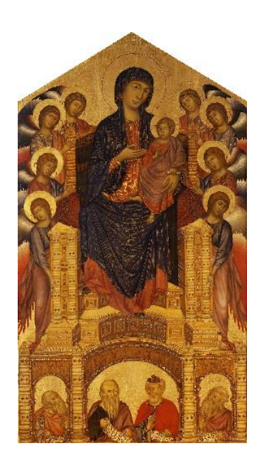
Figure 3. Cimabue, Maesta di Santa Trinita, Tempera On Panel, 385x 223 cm,1286, Uffizi Galery. Italian Renaissance Art, Laurie schenider Adams, Routladge Publish 2013

The city states created by the settled human communities and the social life of the people provided the basis of the first parliamentary democratic regime in Ancient Greek civilization. People's lives get connected to societal law. Citizens of city-states begin to shape their social lives through the laws. This step had a profound impact on the meaning, structure and shape of the individual's identity, social position and sociality in later organizations and formations of states. Following the dissolution of the Roman Empire, a continuation of the ancient Greek culture after the transition from the polytheistic religious system to monotheistic religion a feudal world order and a model of peasant-slave society emerged in the hegemony of the landowners. Feudal system that continued throughout the Middle Ages consisted of many regional administrations connected to agricultural culture and production, which have established their own independent structure on the basis of the common denominator of the religious framework. (Figure 3)