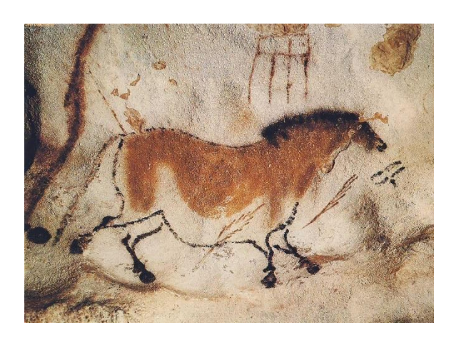
Figure 1: Anonymous, Bison, Sprayed Root Paint on Rock, BC 30.000 Lascaux Cave, France. 'The Story of Human Creativity Across Time and Space'. (2007) Phaidon Publising

In order to hunt collectively people developed a consciousness of acting in an organized way, which enabled people to socialize and was shared in a common way. This relationship serves the most basic function for the transition to established life and society.