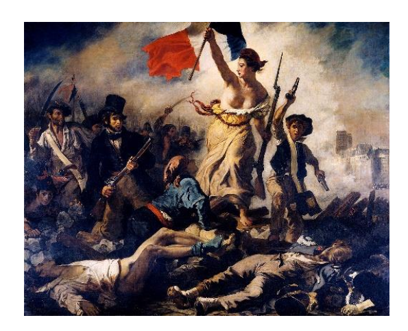
Figure 6. Eugene Delacroix, Liberty, oil on canvans,260x325 cm, Lourve Museum 1830,19th Century Of Art (2010) Florance: Scala Group.

the individualization of human beings are realized. "When people live in a natural state, they have entered into a contract and entered into community life." (Figure 6)