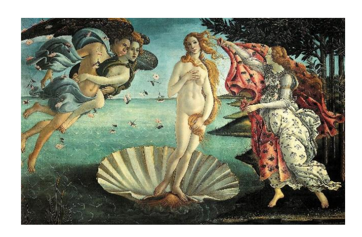
Figure 4, Sandro Boticelli The Birth Of Venus, Oil Painthing,172x278cm 1485, Uffizi Galery. Botticelli, Barbara Deimling Taschen 2000.

At the end of the Middle Ages, within the context of Renaissance and Ancient Greek values, human beings began to become worldly and individualized again. This transformation of human being is reflected in artistic production and shows its effect. Renaissance art Plastic art, literature and music in the fifteenth and sixteenth centuries shaped a new figure of humanity and envisioned the rise of a new type of individual (Legros, 2011: 61) (Figure 4).