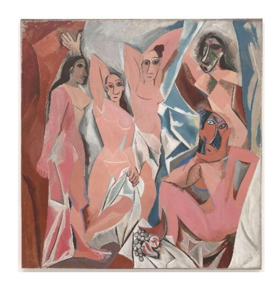
Figure 7: Pablo Picasso, The Girls Of Avignon, oil on canvans, 243x233 cm. The Museum Of Modern Art, 1907. Walther. F. Ingo, (1992) Picasso, Taschen Publishing Hause.

The relationship of the works of art looked at here provided the relationship of these works within their chronological contexts suggests that a summary of the history of civilization is possible and each present a milestone in art history. The subjects and the link we trace here is one where topics of art are grounded on the society and the living conditions to which it was produced and belongs to.