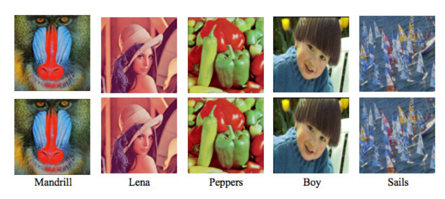
Figure 1: Sample of experimental results. The first row of this figure shows the original cover-image, while the second row shows the corresponding resulting stego-image.

For quantitative evaluation, the lower the value of MSE, the lower the error. The higher PSNR value and SSIM close to 1, i mplies less defects and better visual quality of image. Table 1 shows the calculated PSNR, MSE and SSIM using different lengths of secret message in the five images that are shown in Figure 1. The length of the secret message includes: 52, 105, 158, and 211 characters.